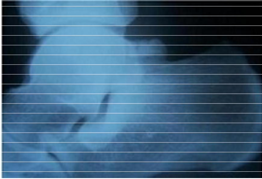
Figure 1. Lateral ankle radiograph shows os trigonum on the right foot and a linear lucency extending anterior to os trigonum with well corticated margins, indicating fibrocartilaginous articulation.