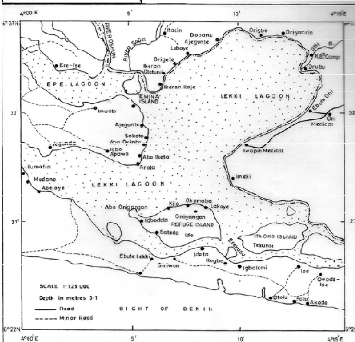
Figure 1. Map of Lekki Lagoon and its environs.

seasonal changes in density and species composition of aquatic plants cause a transition in the spatial and temporal distribution of fish. Egborge (1988) described the water hyacinth as a biological museum containing a wide array of organism like the algae, rotifers, nematodes,