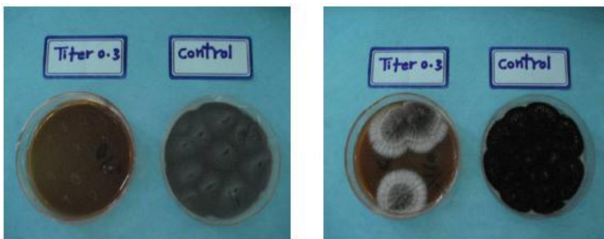
Figure 1. Effect of PAE on Aspergillus fumigatus (left) and A. niger (right) in the dilution of 0.3.

characteristics, macroscopic features and sporulation rate, color and size of colonies (Figures 1 and 2). Microscopic variations were not included for Aspergillus species. Time effectiveness in MIC assay was shown in Table 2. It is clear that 24 h treatment for fungal suspension with P. harmala is much more effective than 2 and 6 h treatment.