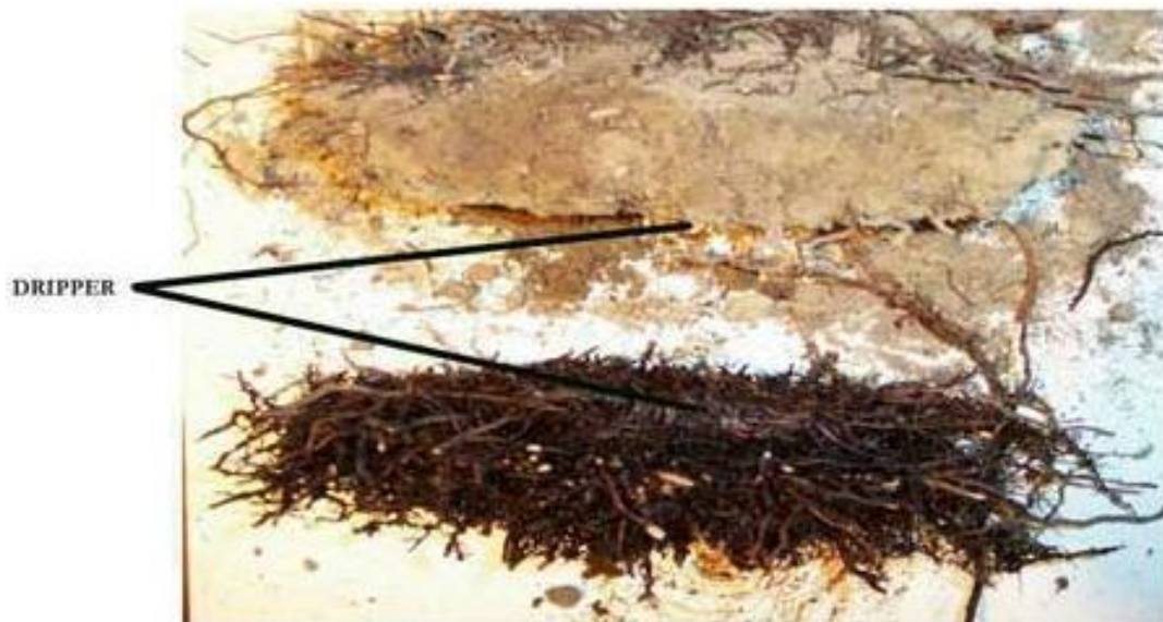
Figure 3. Root density around the emitter opening in SDI system.

z tendency historically limited the service life of the system (Geoflow, 2009). In the condition of SDI system, more volume of roots moved around emitters (Figure 3) and high density of root near source point of moisture caused clog emitters. Application envelope around the emitters applies a burier layer.