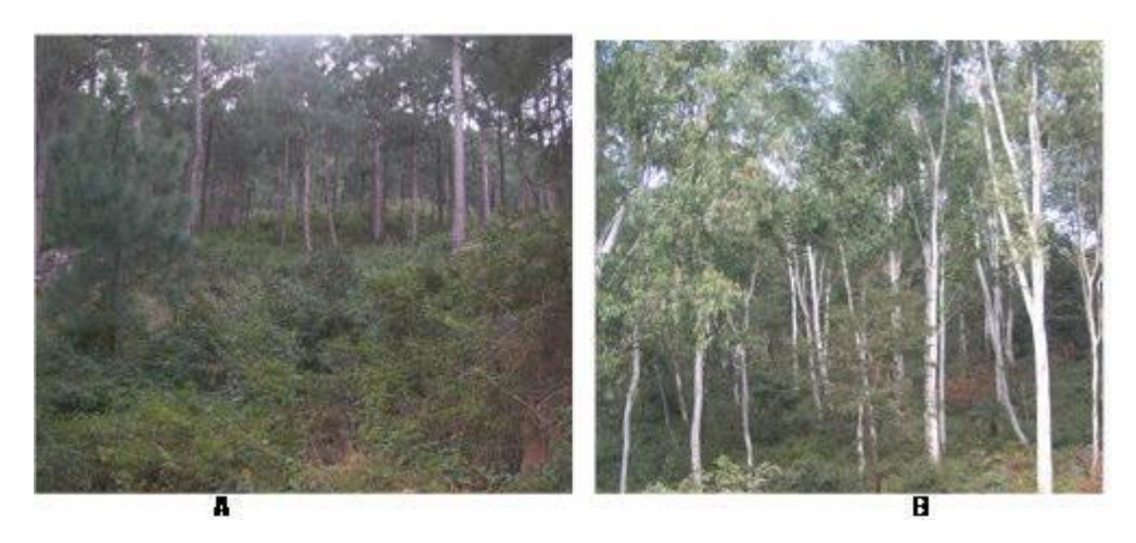
Figure 2. Monoculture plantations of Pinus (A) and Eucalyptus (B) in the Shivalik hills of N.W. Indian Himalayas.