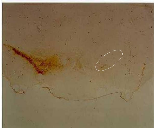
Figure 2. Photomicrograph of representative TH-IR cells in the substantia nigra pars compacta (SNpc). Injection of 6-hydroxydopamine induced cell loss in the right SNpc (indicated area) while the left SNpc remained intact. (X10).

complexity (rectangular 2.5 cm diameter, circular 2.5 cm diameter, rectangular 1 cm diameter, circular 1 cm diameter) (Figure 1B). The complete experiment was performed over 2 consecutive days, carrying out 3 assays per day. The final escape and tumbled down latency figures were computed as the mean of the 6 values obtained from all assays.