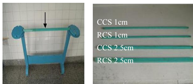
Figure 1. Experimental set prepared for the study of motor coordination through the beam traversal test. A. Two escape platforms are united by means of a beam. The arrow indicates the middle point of the beam where the rat is positioned at the beginning of each assay. B. Beam employed in the test: RCS 2.5cm = transversal beam with rectangular cross section of 2.5cm of diameter, CCS 2.5cm = transversal beam with circular cross section of 2.5cm of diameter, RCS 1cm = transversal beam with rectangular cross section of 1cm of diameter, CCS 1cm = transversal beam with circular cross section of 1cm of diameter.