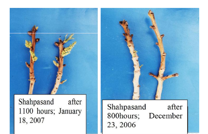
Figure 2. Right Image: (3) Slips of Shahpasand cultivar after 800 h; Left Image: (4) Slips of Shahpasand cultivar after 1100 h.

Figure 1. Right Image: (1) Slips of Abasali cultivar after 500 h; Left Image: (2) Slips of Shahpasand cultivar after 500 h, both cultivars did not showed any bed breaking in after 500 hchilling.