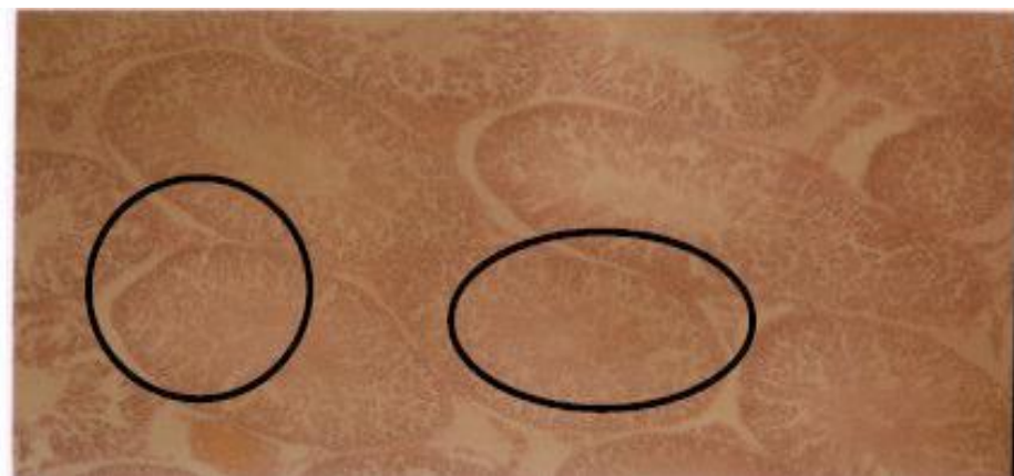
Figure 1. Photomicrograph of testis of rat administered with distilled water (Control). The circled spots indicate well-layered seminiferous tubules (x200).

n = 5± SD; Values carrying superscripts different from the control for each parameter are significantly different (P<0.05).