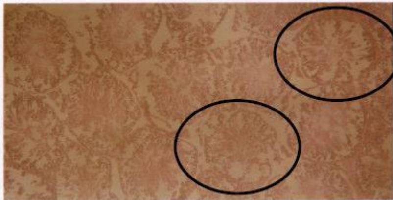
Figure 4. Photomicrograph of testis of rat administered with 100 mg/kg body weight of aqueous extract of Fadogia agrestis stem. The circled spots indicate severe disintegration of the seminiferous tubules with loss of germ cell attachment from the seminiferous epithelium (x200).