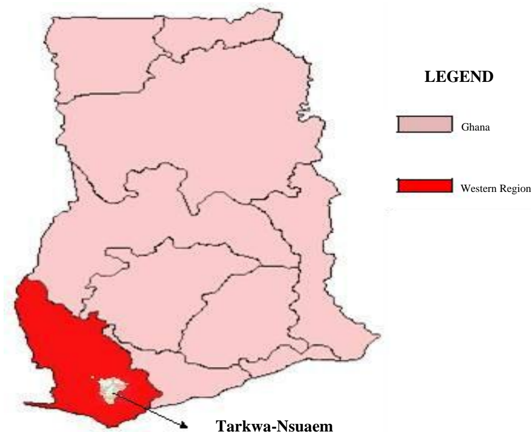
Figure 2. Ghana map showing Western region and Tarkwa-Nsuaem.