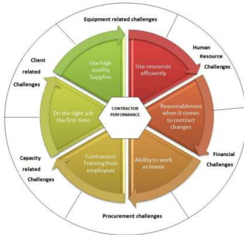
Figure 2. Contractor performance.

biggest mission of UACE is to develop and promote the consulting industry in Uganda. UACE also helps member consultants to keep current in technology. The association works hand in hand with other technical and engineering bodies to improve the state and to promote the use of technology in the country.