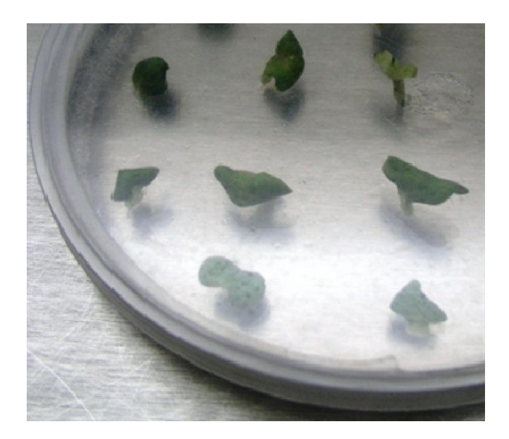
Figure 1. Pre-culturing of cotyledonary petioles of var. Pusa Bold.

Agrobacterium strain gv3101 carrying the binary plasmid vector pBinAR was used for transformation. The vector contains nptll (neomycin phosphotransferase) for the selection of transformants. To carry out genetic transformation, cotyledonary petioles (with 2 mm petiole) were precultured on MS medium supplemented with 2, 4-D, BAP and IAA for a period of 48 hrs (Figure 1) ( Chakrabarty et al., 2002). After 48 hrs, these petioles were co-cultivated with Agrobacterium culture, which was grown overnight in 50 ml liquid YEM containing antibiotics (rifampicin 20 mg/l and kanamycin 50 mg/l) at 28°C (Figure 2). The O.D of culture was maintained at 0.5 with an optimized incubation period (1 - 2 s to 30 min) of explant and Agrobacterium suspension. The cut ends of cotyledonary petioles were dipped in the Agrobacterium suspension from 1 - 2 s to 30 min and then transferred on co-cultivation medium (for 48 h) containing BAP and IAA. After co-cultivation explants were washed with double distilled water (2 - 3 times for 2 - 3 min) and treated with cefotaxime antibiotic solution (250 mg/l) for 5 - 6 min then blotted on sterile filter paper to remove any traces of bacterial contamination and then placed on selection medium with BAP (3.0 mg/l), IAA (0.2 mg/l) containing cefotaxime (250 mg/l) and kanamycin (20 mg/l). Shoot induction started after 15 - 20 days of co-cultivation. Regenerated shoots were excised and transferred to shoot elongation medium. Healthy shoots with an average height of