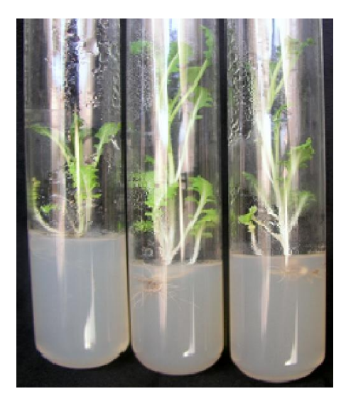
Figure 3. Rooting in putative transformants

Present study clearly demonstrates in vitro regeneration and Agrobacterium mediated transformation of B. juncea variety Pusa Bold. The present process of transformation is simple and easy in operation. However, selection of appropriate explant, choice of Agrobacterium strain with proper media and hormone combination are the major