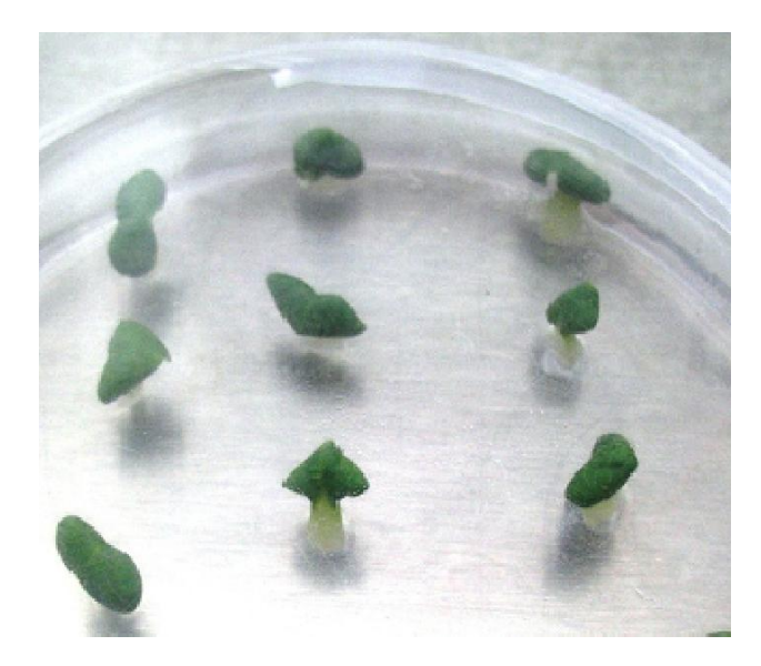
Figure 2. Co-cultivation of pre cultured Cotyledonary petioles

1.5 cm were transferred to the rooting medium, after 3 - 4 weeks when roots grown sufficiently they were transferred to hardening medium containing soil rite. With this method primary transgenic were hardened to get T1 seeds.