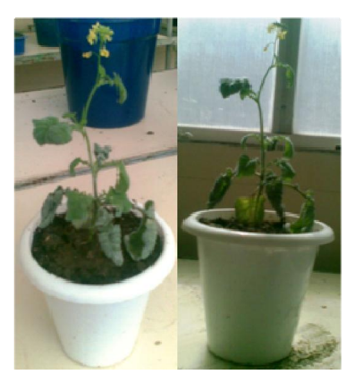
Figure 4. Hardening of putative transformants.

Present study clearly demonstrates in vitro regeneration and Agrobacterium mediated transformation of B. juncea variety Pusa Bold. The present process of transformation is simple and easy in operation. However, selection of appropriate explant, choice of Agrobacterium strain with proper media and hormone combination are the major