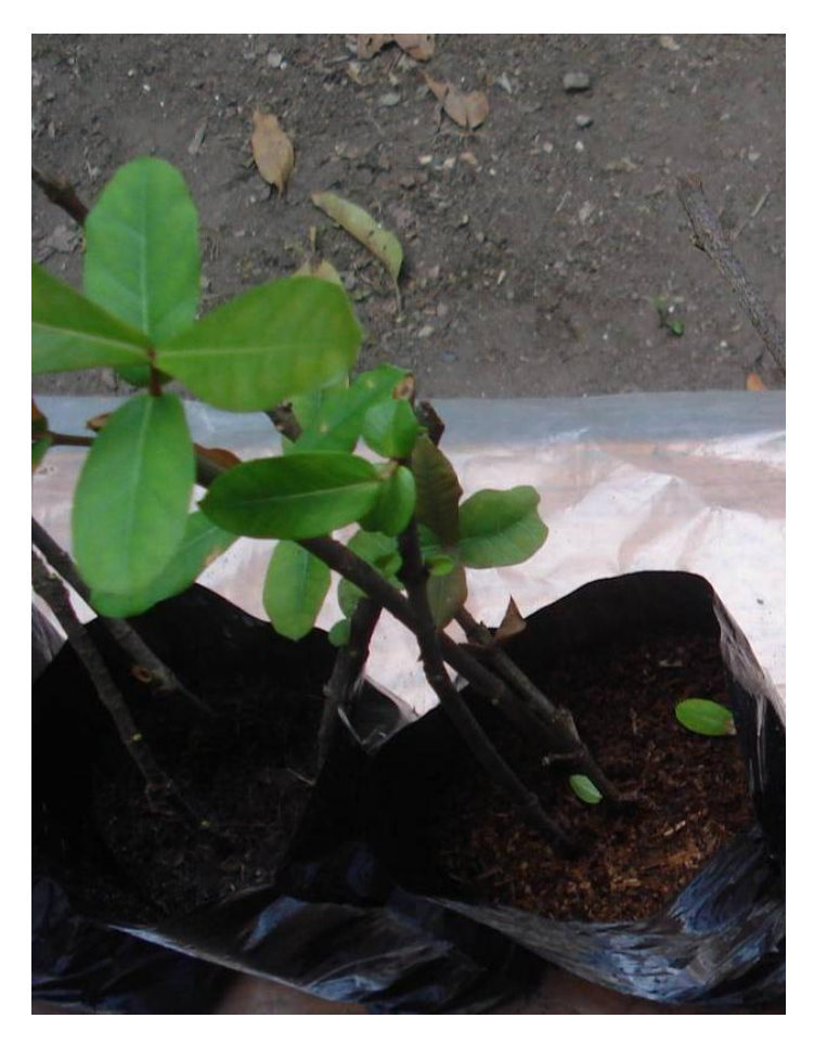
Plate 1. Leaf developments of heel stem cuttings in 50% teak sawdust + 50% coconut coir of I. coccinea . <u>Scales on figures</u>?