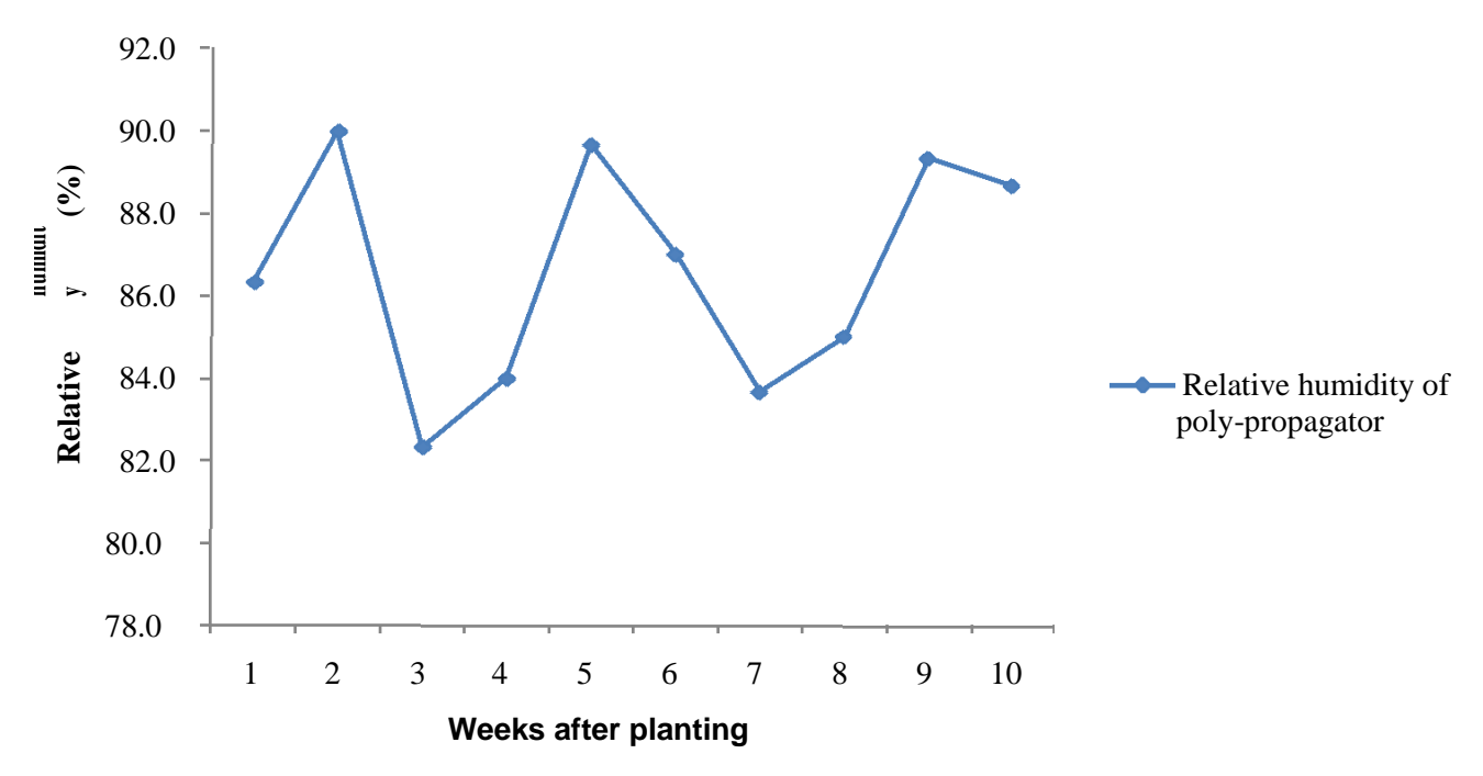
Figure 2. Relative humidity in poly-propagator over time.

media ranged from 23.0 to 34.0°C (Figure 1). Temperature was higher than that in the poly-propagator recorded across the media in the 4th week. By the 2nd. 5th and 9th week temperature of the different media had declined to that of the 1st week and below that of the poly-propagator. Further temperature decreases were observed up to the 10th week across the media and the poly-propagator. The different media recorded higher temperature values in the 4th week due to the low relative humidity conditions in the poly-propagator as a result of intense sunshine thereby trapping more heat. However, as the relative humidity in the ploy-propagator increased due to moderate rainfall from the 5th week of experimentation, the temperatures in the media dropped due to transpiration allowing temperatures in the polypropagator to increase.