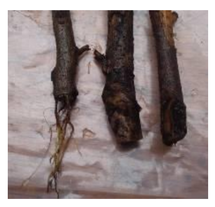
Plate 2. Rooted heel stem cuttings in 50% palmix + 25% teak sawdust + 25% coconut coir in F. benjamina cv. "Starlight" scales

types and the stem cutting by media interaction of F. benjamina in the number of days to sprouting, number of stem cuttings that survived, number rooted and also the root length per cuttings. Straight stem cuttings however sprouted earlier (2.98 days) and had more survived cuttings (0.85) with more roots (0.82) of longer root lengths (1.06 cm).