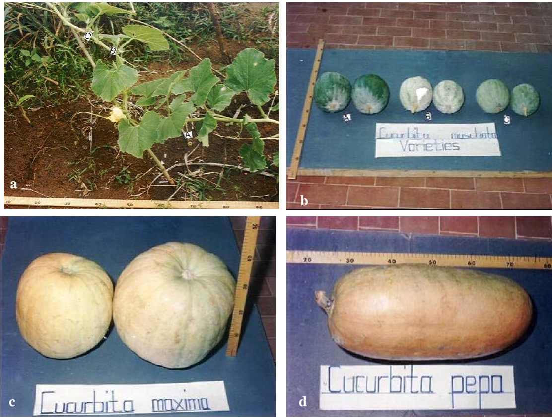
Figure 1(a-d). Characteristic features of habit and fruits Cucurbita species studied. a-habit of Cucurbita species showing severely coiled tendrils represented with letter 'a'; b- three fruit varieties of C. moschata . ; these varietal forms are occasionally produced by one plant; c-fruit of C. maxima ; fruit stalk is deeply depressed into the fruit forming a globose invagination ; d- fruit of C. pepo ; fruit stalk is round, neither depressed nor sunken into the fruit.

anatomy will also provide a guide and basis for studies leading to further exploitation of these important vegetable species.